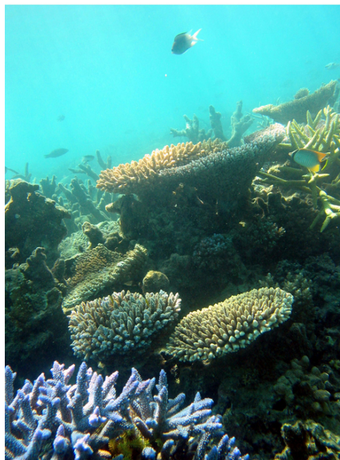
Figure 44.23 Coral reefs are formed by the calcium carbonate skeletons of coral organisms, which are marine invertebrates in the phylum

It is estimated that more than 4,000 fish species inhabit coral reefs. These fishes can feed on coral, the cryptofauna (invertebrates found within the calcium carbonate substrate of the coral reefs), or the seaweed and algae that are associated with the coral. In addition, some fish species inhabit the boundaries of a coral reef; these species include predators, herbivores, and planktivores , which consume planktonic organisms such as bacteria, archaea, algae, and protists floating in the pelagic zone.