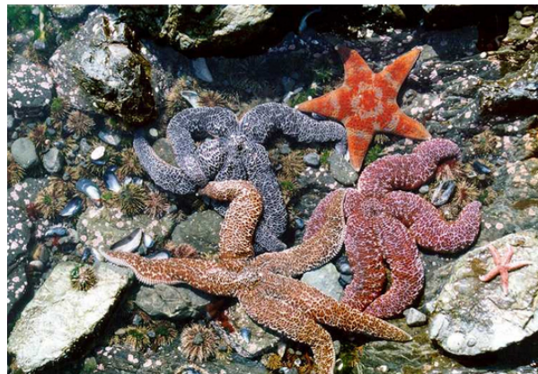
Figure 44.22 Sea urchins, mussel shells, and starfish are often found in the intertidal zone, shown here in Kachemak Bay, Alaska.

The intertidal zone , which is the zone between high and low tide, is the oceanic region that is closest to land ( Figure 44.21 ). Generally, most people think of this portion of the ocean as a sandy beach. In some cases, the intertidal zone is indeed a sandy beach, but it can also be rocky or muddy. The intertidal zone is an extremely variable environment because of action of tidal ebb and flow. Organisms are exposed to air and sunlight at low tide and are underwater most of the time, especially during high tide. Therefore, living things that thrive in the intertidal zone are adapted to being dry for long periods of time. The shore of the intertidal zone may also be repeatedly struck by waves, and the organisms found there are adapted to withstand damage from their pounding action ( Figure 44.22 ). The exoskeletons of shoreline crustaceans (such as the shore crab, Carcinus maenas ) are tough and protect them from desiccation (drying out) and wave damage. Another consequence of the pounding waves is that few algae and plants establish themselves in the constantly moving rocks, sand, or mud.