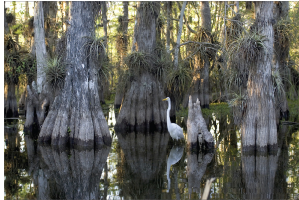
Figure 44.25 Located in southern Florida, Everglades National Park is vast array of wetland environments, including sawgrass marshes, cypress swamps, and estuarine mangrove forests. Here, a great egret walks among cypress trees.

Wetlands are environments in which the soil is either permanently or periodically saturated with water. Wetlands are different from lakes because wetlands are shallow bodies of water whereas lakes vary in depth. Emergent vegetation consists of wetland plants that are rooted in the soil but have portions of leaves, stems, and flowers extending above the water's surface. There are several types of wetlands including marshes, swamps, bogs, mudflats, and salt marshes (Figure 44.25). The three shared characteristics among these types—what makes them wetlands—are their hydrology, hydrophytic vegetation, and hydric soils.