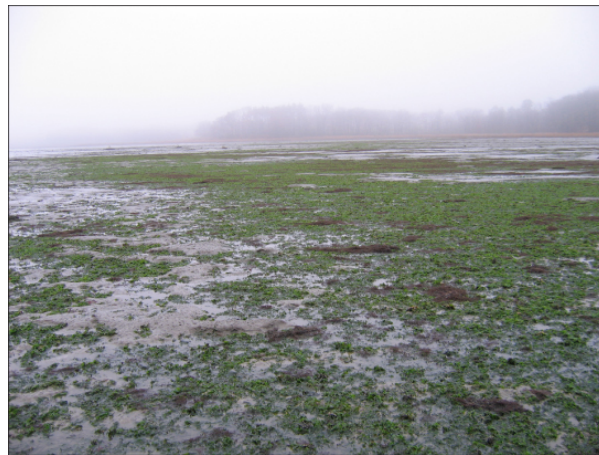
Figure 44.24 The uncontrolled growth of algae in this lake has resulted in an algal bloom.

Nitrogen and phosphorus are important limiting nutrients in lakes and ponds. Because of this, they are the determining factors in the amount of phytoplankton growth that takes place in lakes and ponds. When there is a large input of nitrogen and phosphorus (from sewage and runoff from fertilized lawns and farms, for example), the growth of algae skyrockets, resulting in a large accumulation of algae called an algal bloom . Algal blooms (Figure 44.24) can become so extensive that they reduce light penetration in water. They may also release toxic byproducts into the water, contaminating any drinking water taken from that source. In addition, the lake or pond becomes aphotic, and photosynthetic plants cannot survive. When the algae die and decompose, severe oxygen depletion of the water occurs. Fishes and other organisms that require oxygen are then more likely to die, resulting in a dead zone. Lake Erie and the Gulf of Mexico represent freshwater and marine habitats where phosphorus control and storm water runoff pose significant environmental challenges.